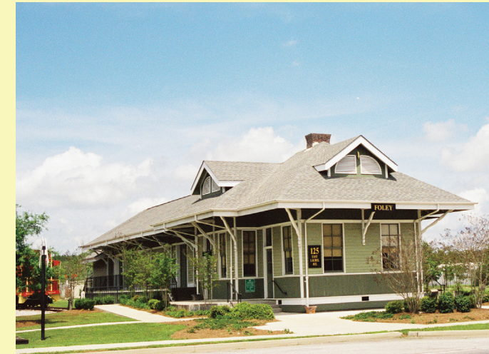
D16. Foley Depot & City Museum and Archives Latitude: 30°24'23.76"N / Longitude: 87°40'58.99"W