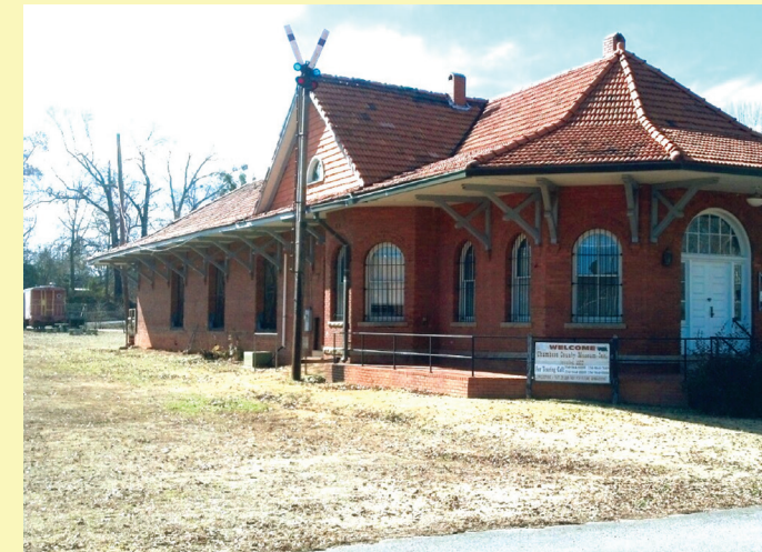
D24. Lafayette C of GA Depot Latitude: 32°53'55.90"N / Longitude: 85°24'16.35"W