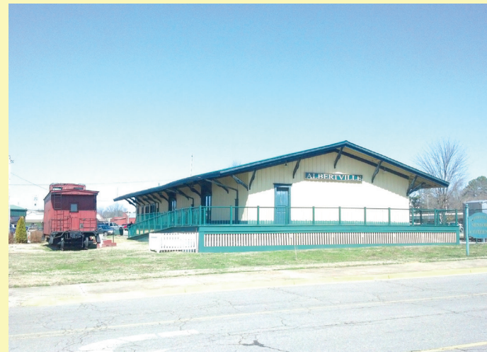
D1. Albertville Depot Latitude: 34°15'59.76"N / Longitude: 86°12'22.53"W