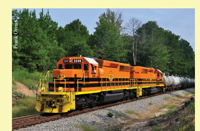
Columbus & Chattahoochee - Holy Trinity