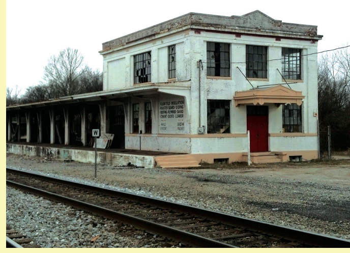
D5. Bessemer Freight Depot Latitude: 33°23'57.90"N / Longitude: 86°57'6.20"W