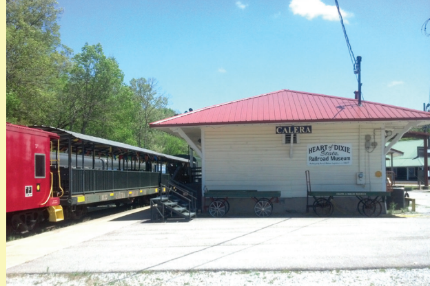
M2. Heart of Dixie Railroad Museum - Calera Latitude: 33°5'55.18"N / Longitude: 86°44'58.57"W