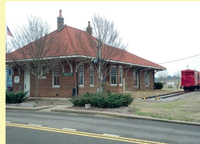
D15. Fayette Depot Latitude: 33°41'0.58"N / Longitude: 87°49'50.52"W