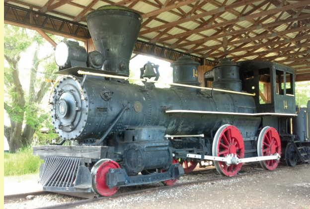
M1. The Pioneer Museum - Troy Latitude: 31°49'28.38"N / Longitude: 85°59'46.01"W