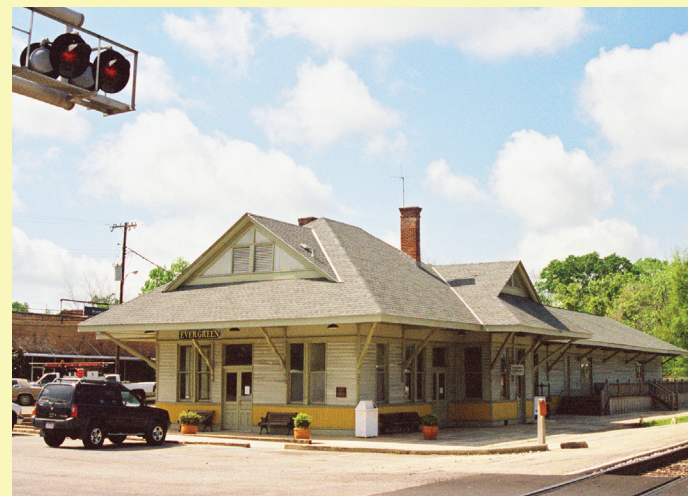
D13. Evergreen Depot Latitude: 31°25'57.83"N / Longitude: 86°57'20.09"W