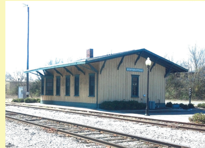
D19. Guntersville Depot Latitude: 34°21'6.55"N / Longitude: 86°17'45.18"W