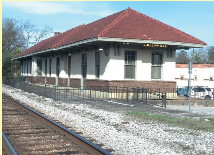
D18. Greenville L & N Depot Latitude: 31°49'45.36"N / Longitude: 86°37'40.13"W