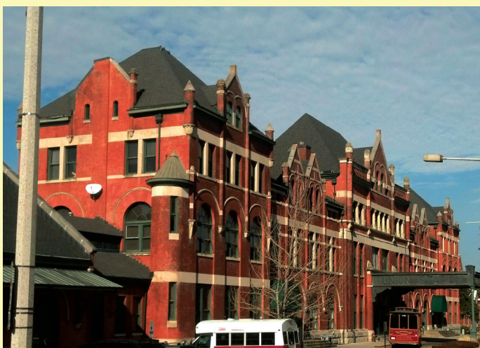
D30. Montgomery Union Station Depot Latitude: 32°22'49.83"N / Longitude: 86°18'50.40"W