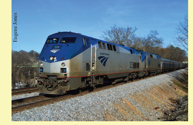
Amtrak Crescent - Birmingham