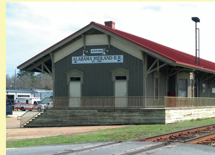
D3. Ashford Depot Latitude: 31°11'0.01"N / Longitude: 85°14'14.36"W