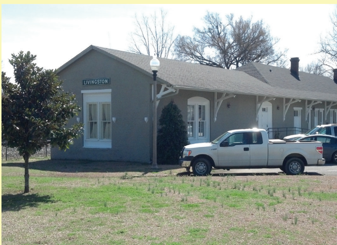
D26. Livingston SOU Depot Latitude: 32°34'51.08"N / Longitude: 88°11'6.42"W