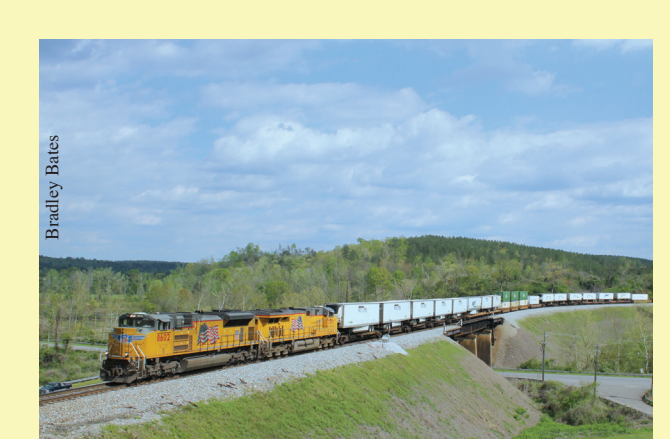
Union Pacific - Cordova