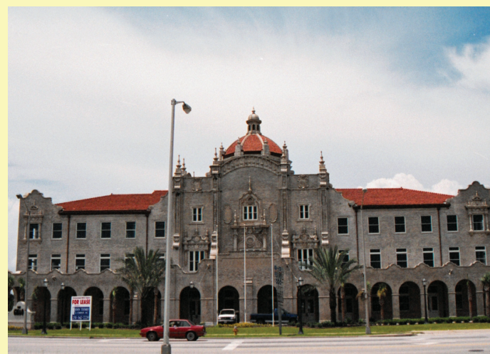
D29. Mobile GM & O Depot Latitude: 30°42'1.52"N / Longitude: 88°2'43.86"W