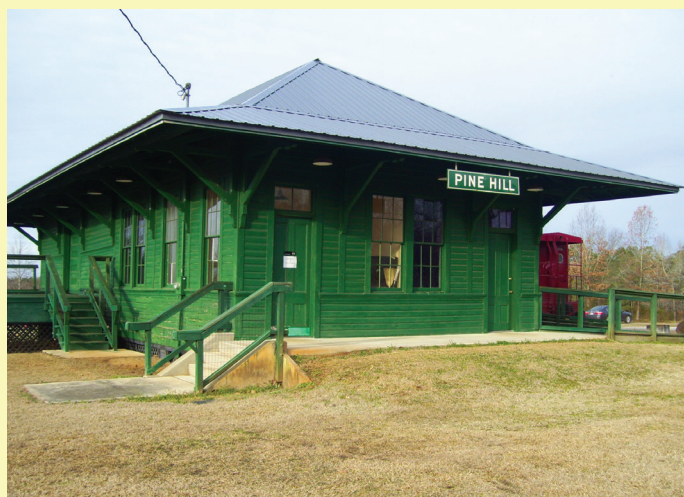
D34. Pine Hill SOU Depot Latitude: 31°59'20.41"N / Longitude: 87°35'25.64"