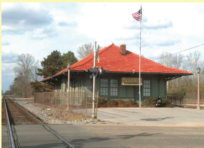
D27. Maplesville SOU Depot Latitude: 32°47'20.87"N / Longitude: 86°52'11.44"W