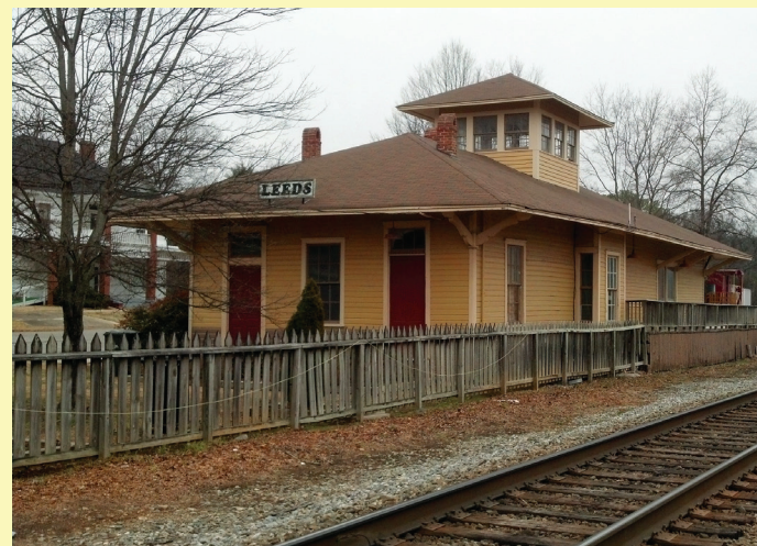
D25. Leeds AGS Depot Latitude: 33°32'37.76"N / Longitude: 86°32'21.25"W