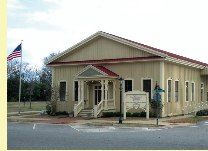
D12. Eufaula Depot Latitude: 31°53'25.42"N / Longitude: 85°8'39.47"W