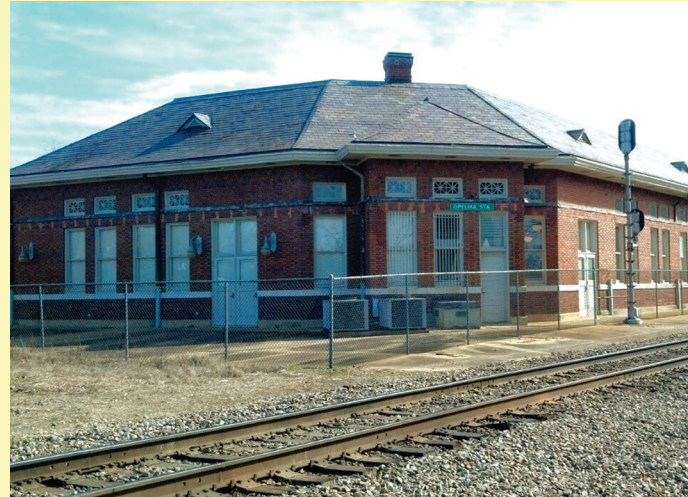
D33. Opelika Depot Latitude: 32°38'43.44"N / Longitude: 85°22'56.79"W

Note: Due to space limitations, only "Transportation Enhancement Funded" Depots have been listed on this edition.