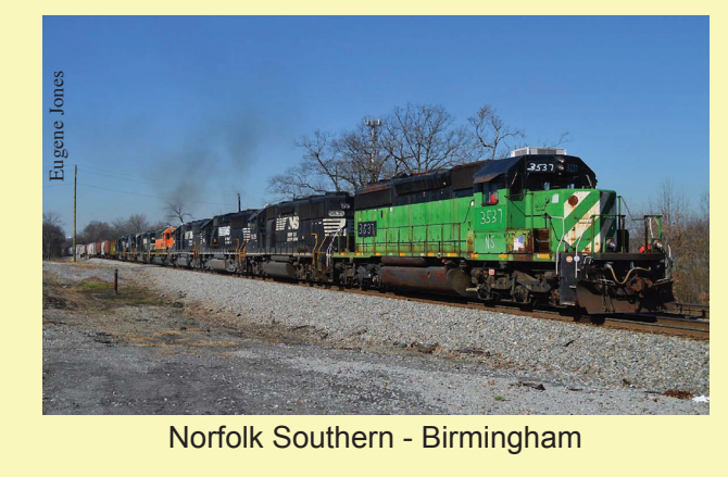
Norfolk Southern - Birmingham