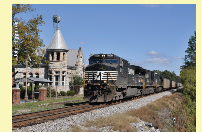
Norfolk Southern - Fort Payne