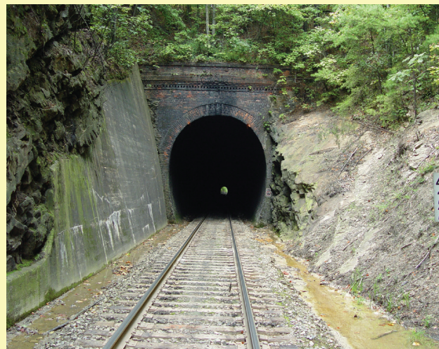
T2. Oak Tunnel - NS P - Line - East Portal Latitude: 33°30'59.59"N / Longitude: 86°32'39.84"W (3 miles south of Leeds)