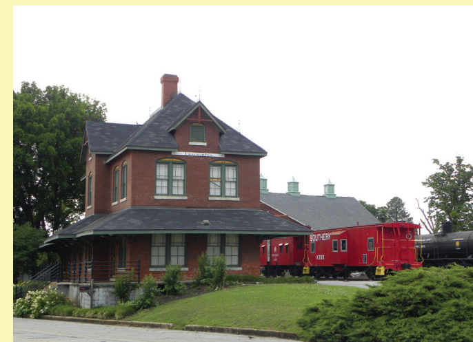
D36. Tusculumbia M & C Depot & Railroad Museum Latitude: 34°43'57.19"N / Longitude: 87°42'20.50"W