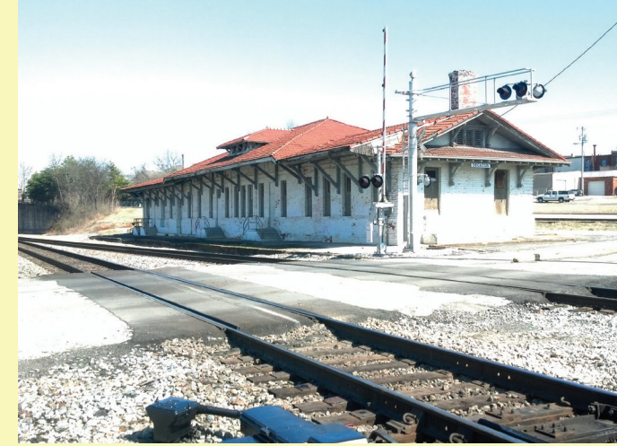
D11. Decatur Depot Latitude: 34°36'48.69"N / Longitude: 86°59'11.53"W