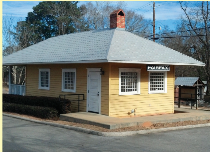
D14. Fairfax Depot (Valley) Latitude: 32°47'41.04"N / Longitude: 85°10'53.52"W