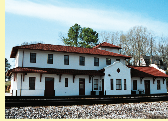
D7. Bridgeport Depot Latitude: 34°56'54.82"N / Longitude: 85°42'39.92"W