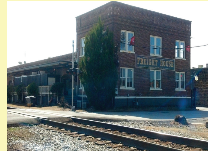
D20. Hartselle L & N Freight Depot Latitude: 34°26'34.80"N / Longitude: 86°55'58.49"W