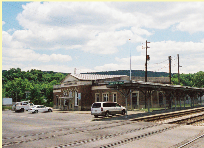
D2. Anniston Amtrak Station Latitude: 33°38'56.55"N / Longitude: 85°49'55.71"W

Note: Due to space limitations, only "Transportation Enhancement Funded" Depots have been listed on this edition.