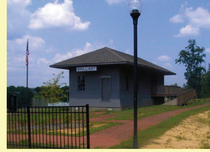
D8. Brilliant Depot Latitude: 34°1'41.15"N / Longitude: 87°45'15.68"W