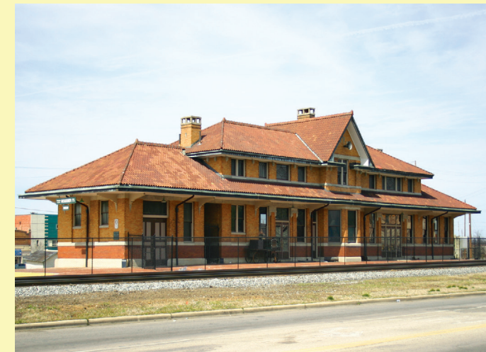
D4. Bessemer Depot & Hall of History Museum Latitude: 33°24'4.32"N / Longitude: 86°57'0.78"W