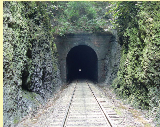
T1. Coosa Tunnel - NS P - Line - East Portal Latitude: 33°28'52.98"N / Longitude: 86°31'55.72"W (4 miles south of Leeds)