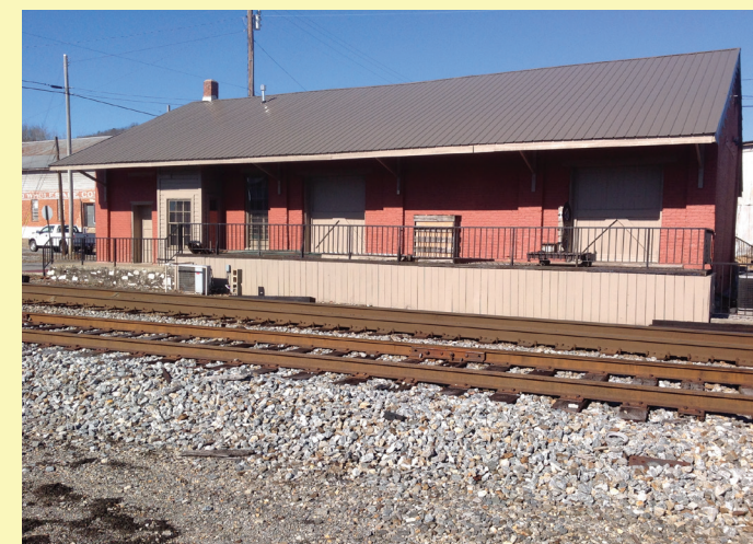
D35. Scottsboro Depot Latitude: 34°40'30.30"N / Longitude: 86°2'12.98"W