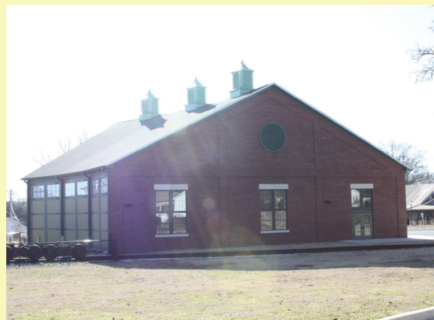
D37. Tusculumbia Roundhouse Latitude: 34°43'58.86"N / Longitude: 87°42'22.55"W