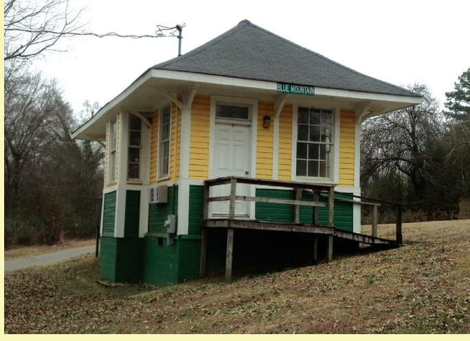
D6. Blue Mountain Depot Latitude: 33°41'17.45"N / Longitude: 85°50'27.51"W