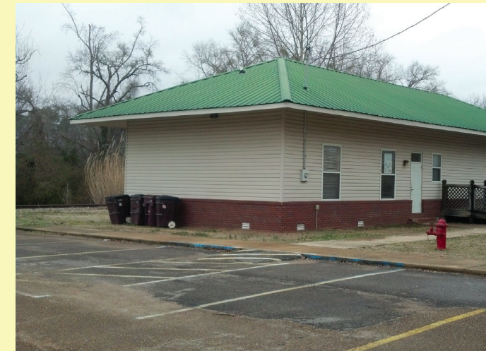
D23. Kennedy Depot Latitude: 33°35'16.07"N / Longitude: 87°59'5.05"W