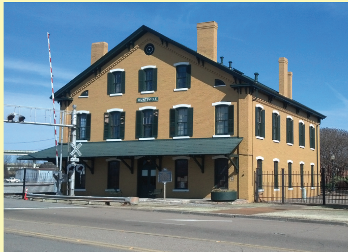
D22. Huntsville Depot & Transportation Museum Latitude: 34°44'4.19"N / Longitude: 86°35'26.85"W