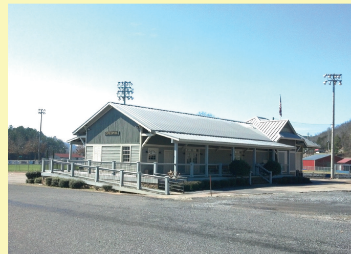
D32. Oneonta Depot Latitude: 33°56'26.58"N / Longitude: 86°29'24.61"W