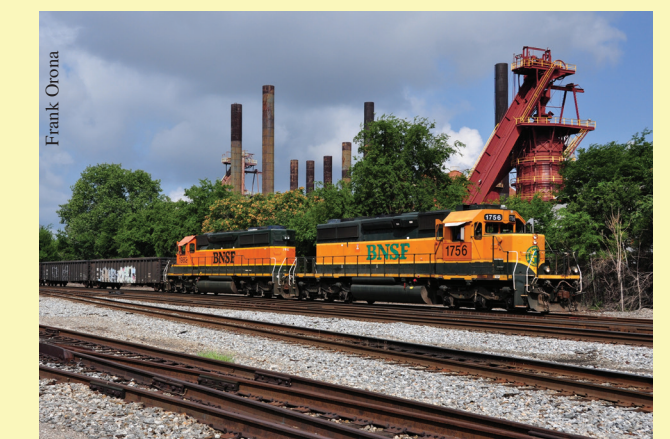
BNSF passing Sloss Furnaces - Birmingham