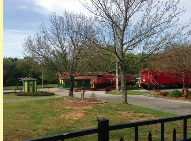
M4. The North Alabama Railroad Museum - Chase Latitude: 34°46'59.95"N / Longitude: 86°32'45.85"W