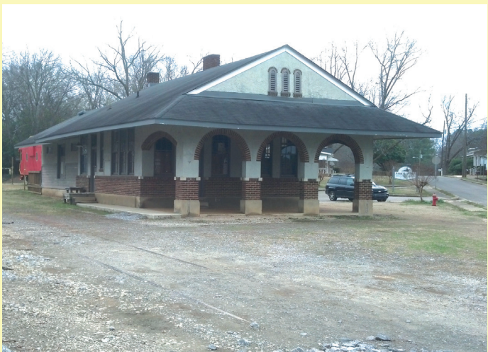
D31. Northport GM & O Depot Latitude: 33°13'17.05"N / Longitude: 87°34'54.43"W