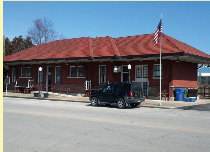
D21. Hartselle L & N Passenger Depot Latitude: 34°26'36.71"N / Longitude: 86°55'59.28"W