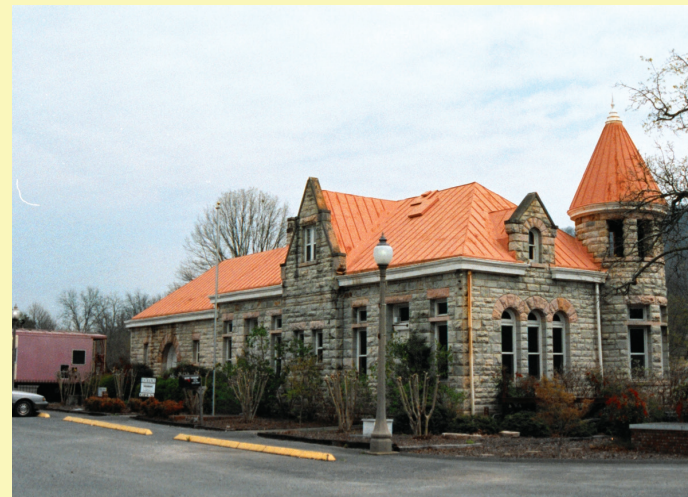
D17. Fort Payne Depot Latitude: 34°26'39.43"N / Longitude: 85°43'6.50"W