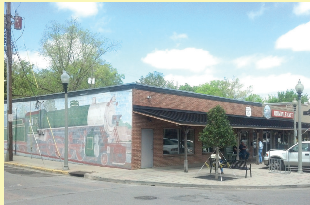
M3. The Irondale Cafe - famous as the "Whistle Stop Cafe" from the book and movie "Fried Green Tomatoes" Latitude: 33°32'19.03"N / Longitude: 86°42'29.64"W