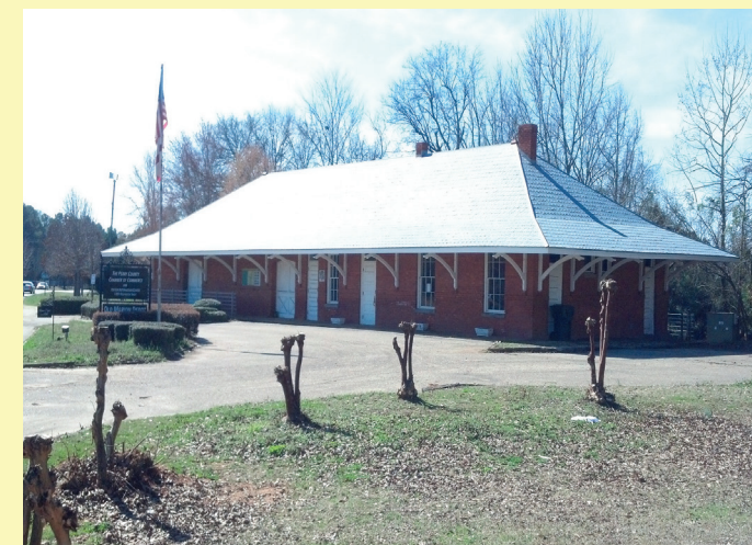
D28. Marion SOU Depot Latitude: 32°37'4.74"N / Longitude: 87°19'3.44"W