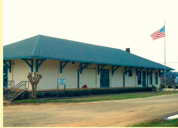
D9. Clayton Depot Latitude: 31°52'34.42"N / Longitude: 85°26'45.97"W