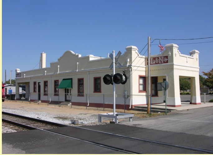
D10. Cullman L & N Depot Latitude: 34°10'46.92"N / Longitude: 86°50'41.06"W