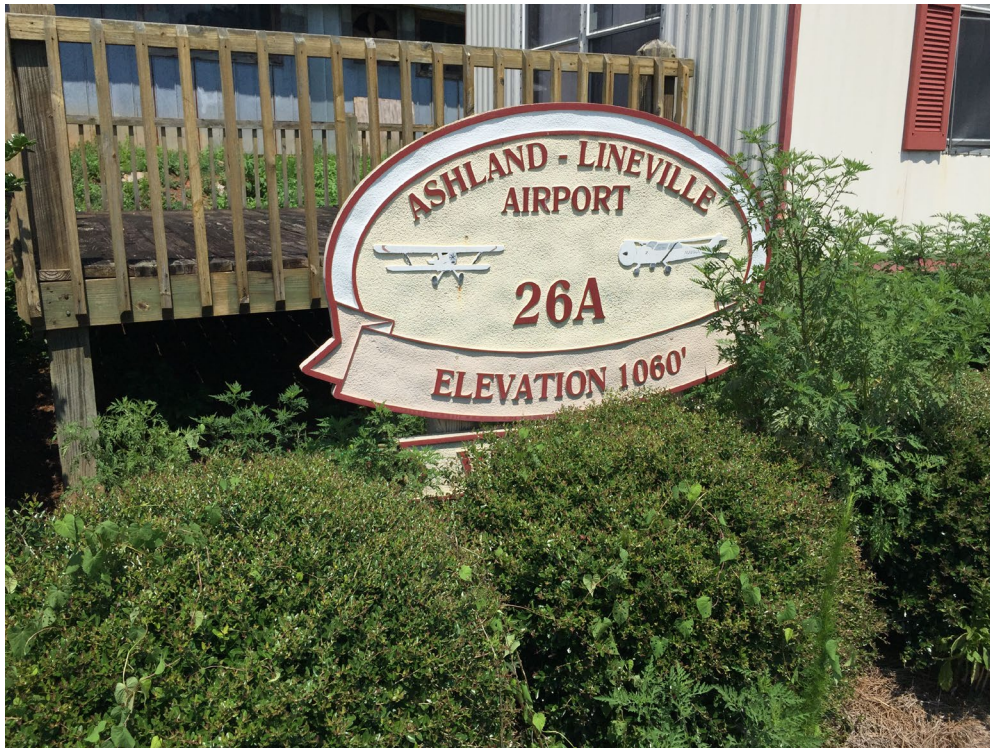
Ashland-Lineville Municipal Airport (26A) Ashland, Alabama