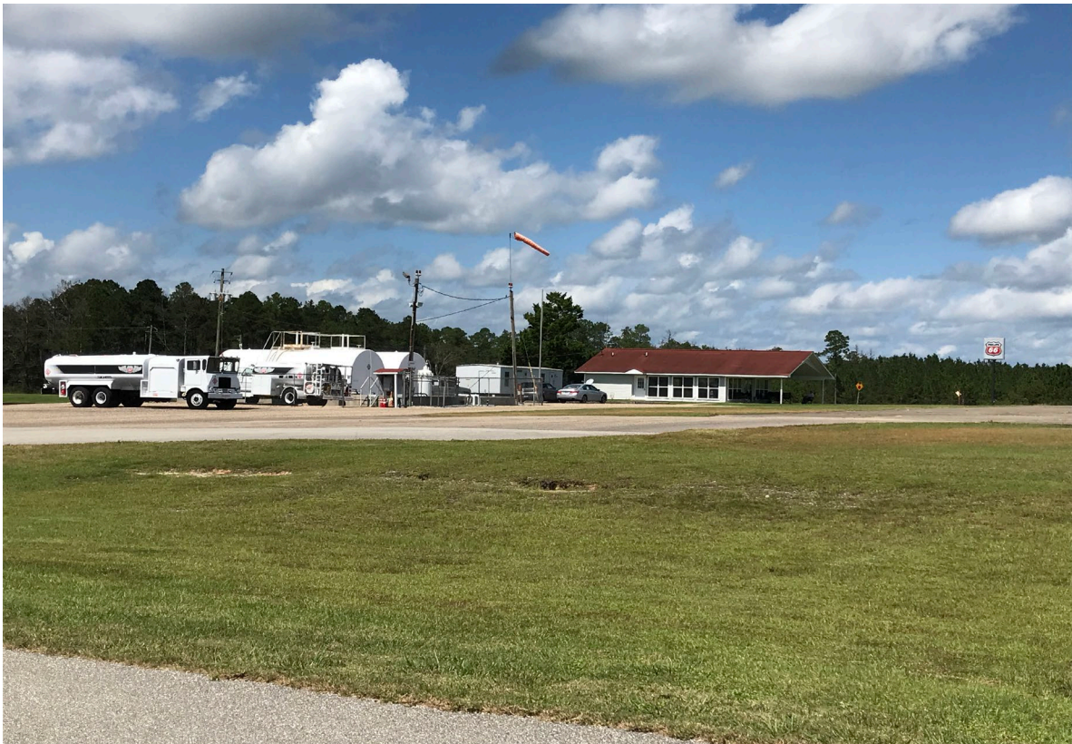
FLORALA MUNICIPAL AIRPORT (0J4) FLORALA, ALABAMA