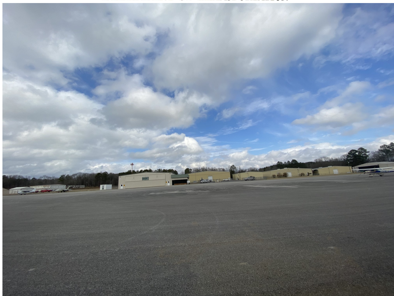
WALKER COUNTY AIRPORT JASPER, ALABAMA