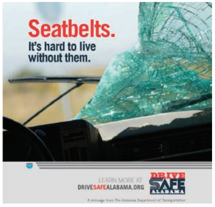
One of the examples from our digital ad campaign covering the importance of seatbelt use.