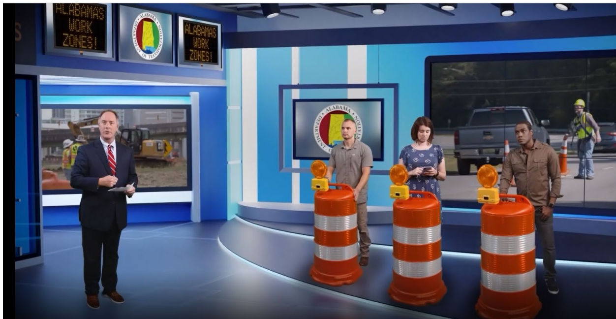
Changes to Work Zone Fines Featured in New PSA from ALDOT