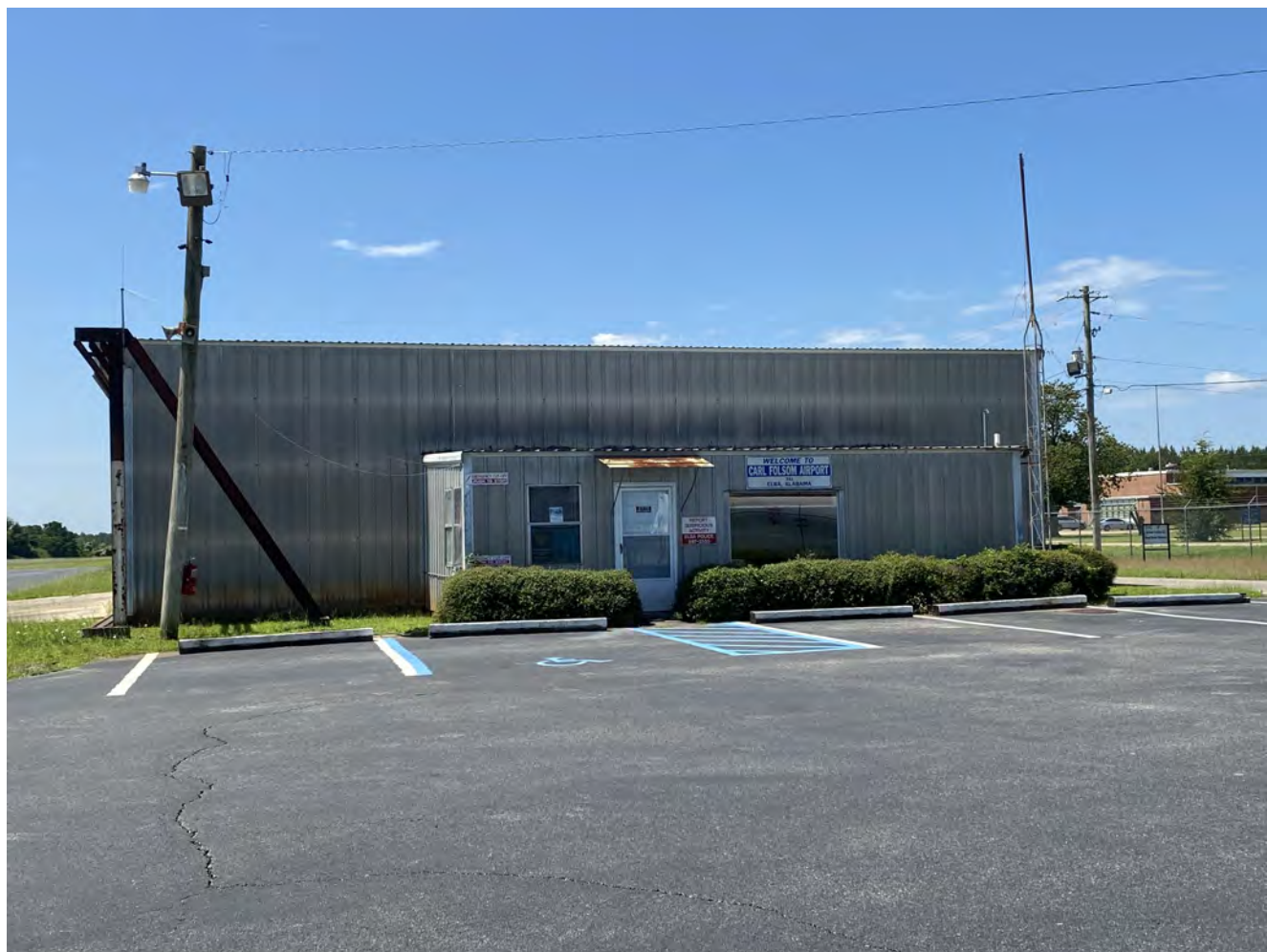
CARL FOLSOM AIRPORT ELBA, ALABAMA