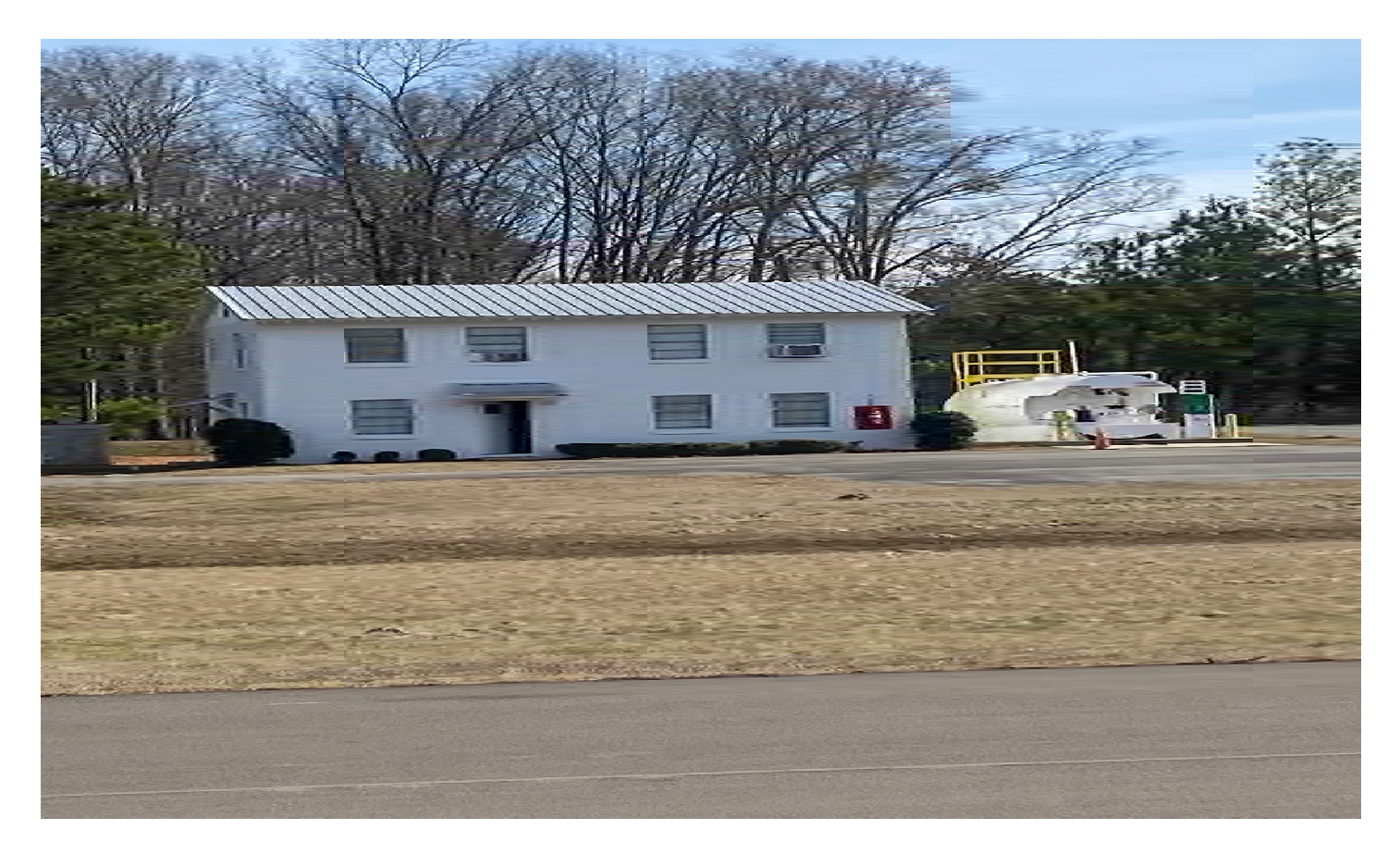
GREENSBORO MUNICIPAL AIRPORT GREENSBORO, ALABAMA