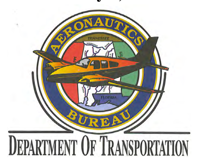
February 1, 2024