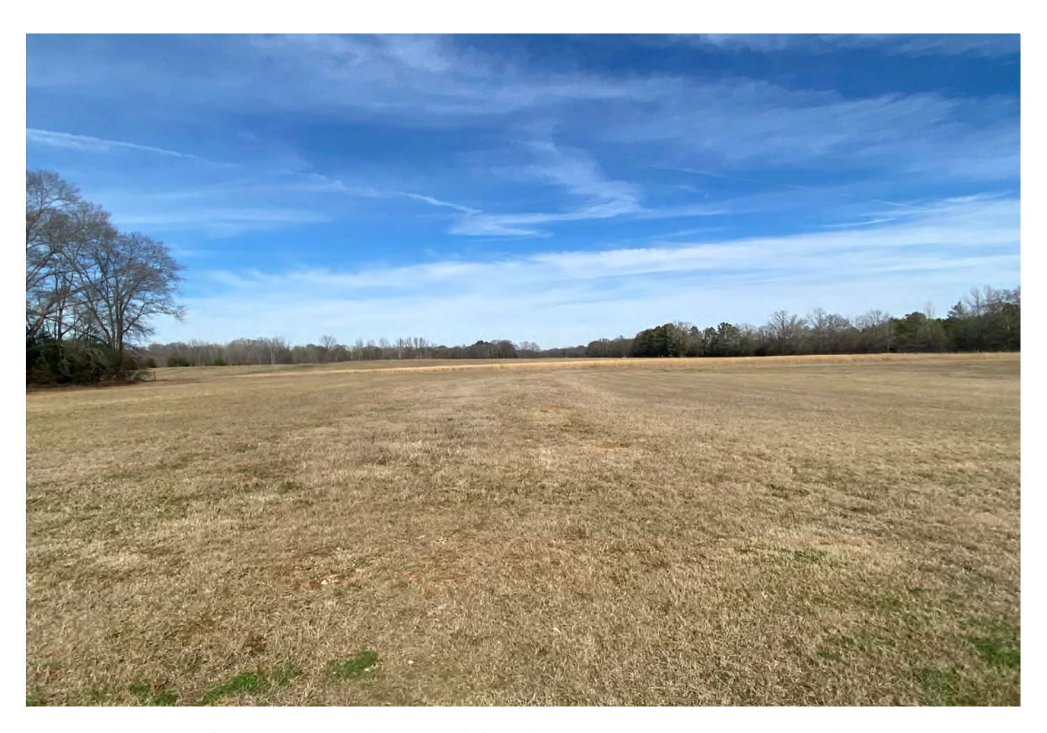
No Obstructions were located in the ALDOT Approach/ Departure Path of Runway 18.