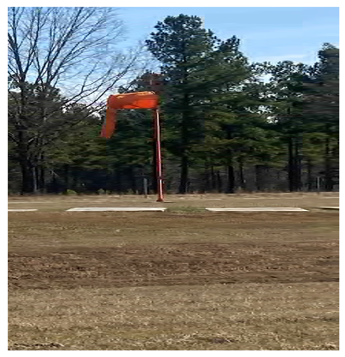
Wind direction indicator is in GOOD condition.