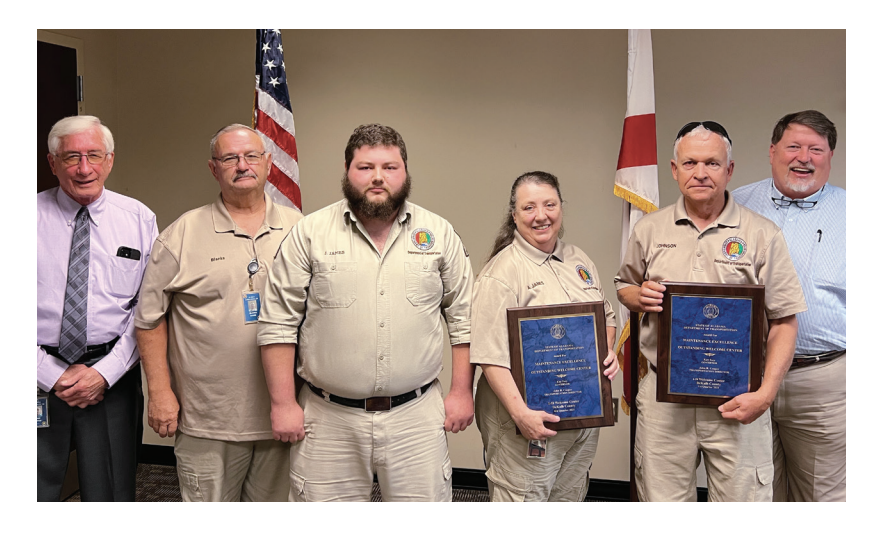
Welcome Center Winner for the 4th Quarter